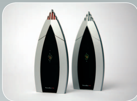
SOUNDEARPRO, WIRELESS SOUND LEVEL METER