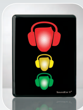
SOUNDEAR II INDUSTRY, WIRELESS DISPLAY